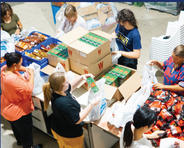
International Christians rallying around a traumatized nation, opening their hearts to give generously, making this the year with the highest donation income in our history