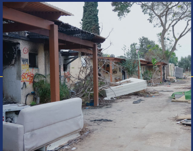
Walking alongside Israel through October 7 and its aftermath