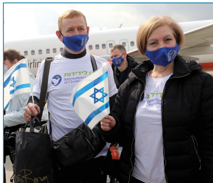
Ukrainian immigrants touch down at Ben Gurion Airport. Every week, more Jewish people come home from the nations in fulfillment of Bible prophecy.

the barbecue and will not be able to understand the speeches in Hebrew. Many of them are women, elderly people and children, as the men of fighting age have not been permitted to leave Ukraine. Their lives are fragile, and anxiety is a common companion. The pain of loss and the trauma from war have deeply impacted their lives.