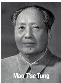
Mao T'se Tung