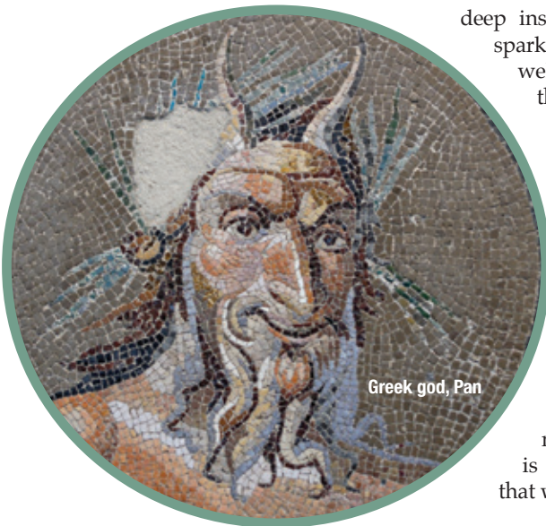
Greek god, Pan

I believe that at a certain level, deep inside where that divine spark dwells, people then (as well as now) recognized the truth of the message brought to the world by the Jewish people. And once they heard it, they had to decide what to do with it. If they were unwilling to embrace it, they had to handle it in some other way. We have a saying in America, "shoot the messenger." And that is unfortunately the path that was chosen.